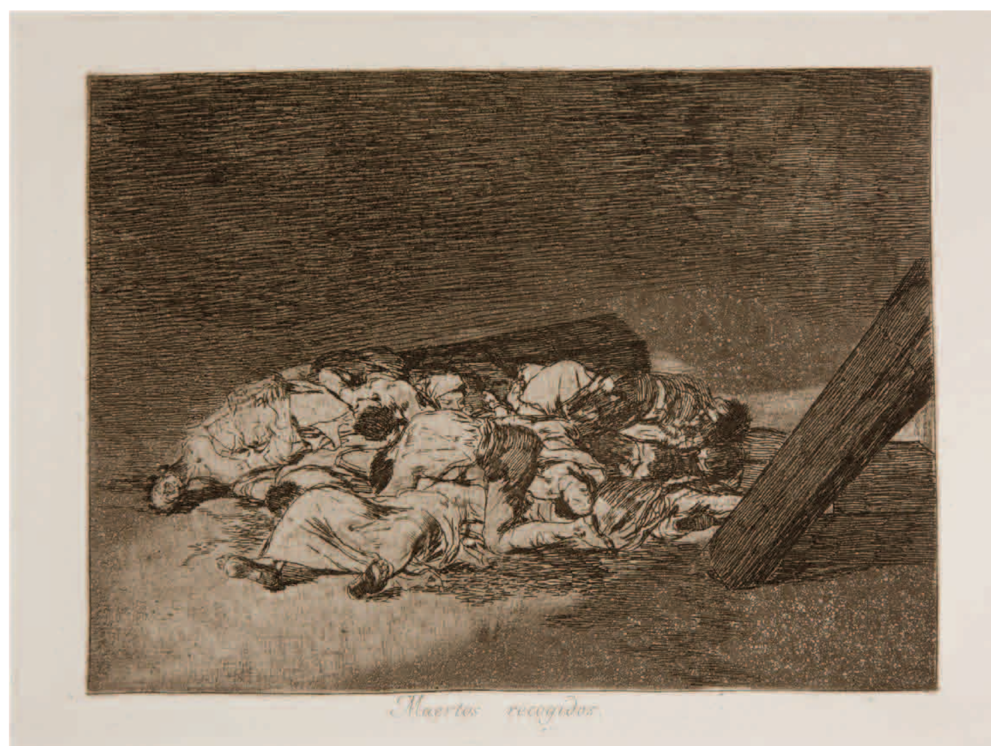
Francisco de Goya “Dead collected”, The disasters of war (Disaster 63).

“ZARAGOZA IN HONOUR OF ITS ANONYMOUS DEFENDERS BURIED HERE IN THEIR THOUSANDS, VICTIMS OF WAR AND DISEASE, IN THE SIEGES THE CITY UNDERWENT IN 1808 AND 1809”