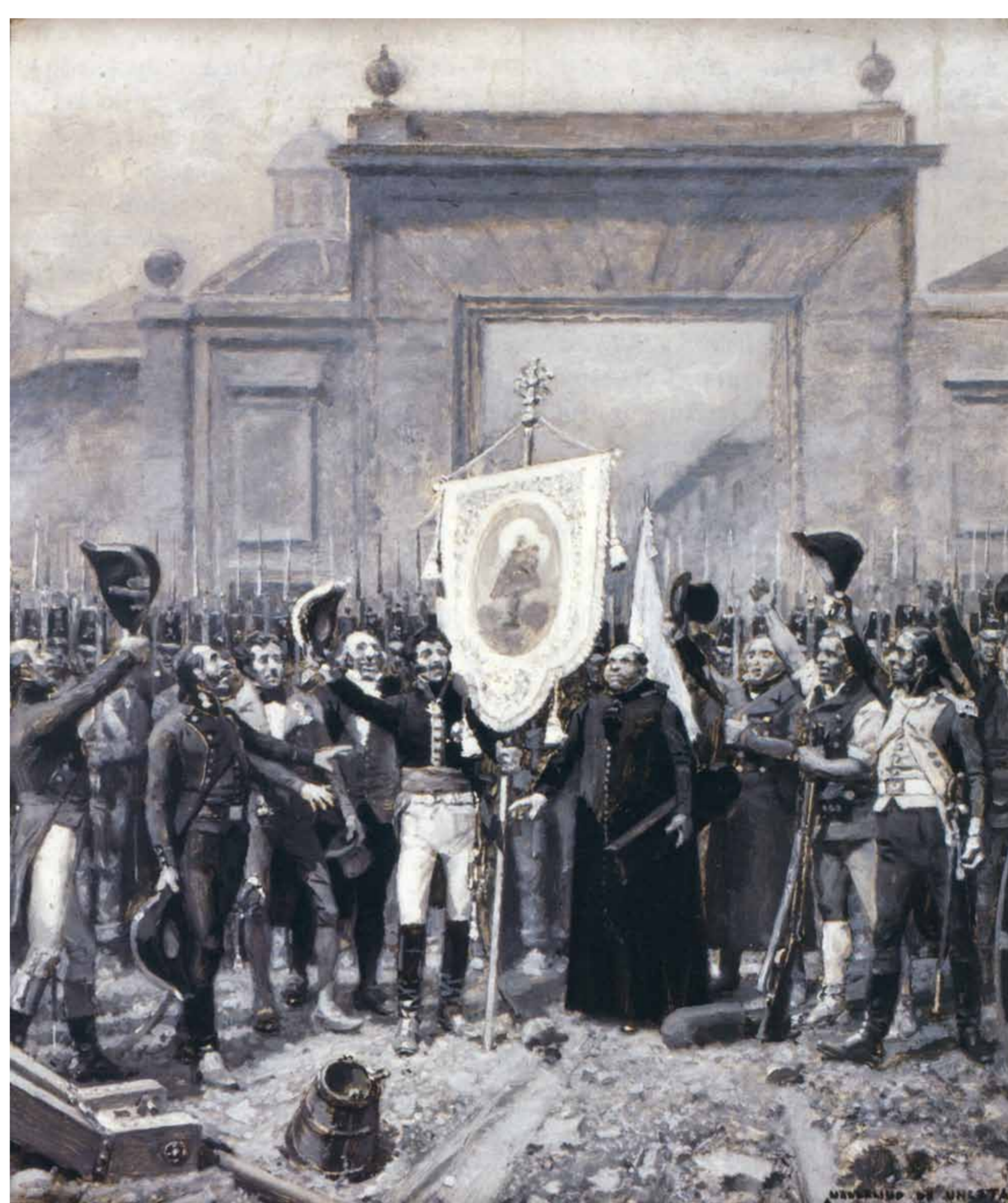
26 June 1808. Solemn civic oath in Zaragoza. Marcelino de Unceta, 1898. Private collection. Madrid.

In the gate walls, it is still possible to see the numerous artillery impacts which they withstood during the confrontations. On one side, there are several bullet holes and numerous signs of French cannons, on the other side, which faces the city interior, there are only the marks of the Aragon rifles.