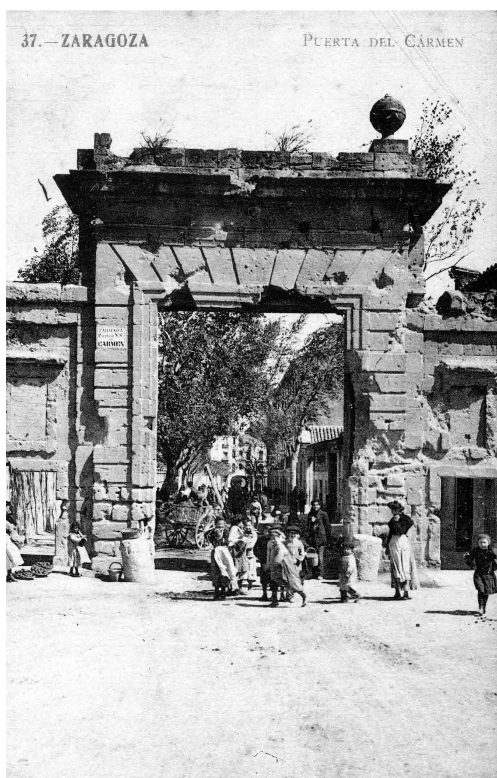
Zaragoza. Puerta del Carmen